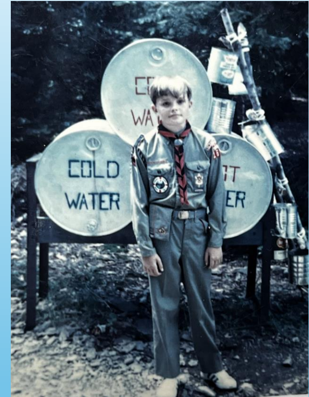
Goose Pond Scout Reservation Summer Camp, 1972

(I remember what it's like to be a new scout!)