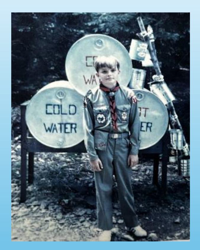
Goose Pond Scout Reservation Summer Camp, 1972 (I remember what it's like to be a new scout!)

New Scout Patrol Meetings at HSLC 7PM on PLC meeting nights. Watch for the agenda email from the Troop Guides.